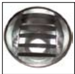
IL45/IL75 Internal 45° or 75° Louver Shielding