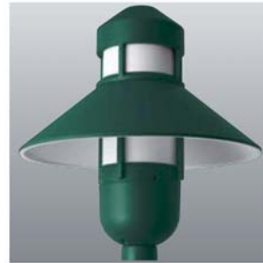
ZAV21-CTW-S / ZAV24-CTW-S