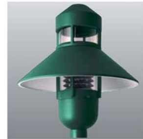
ZAV21-CTW-CLL / ZAV24-CTW-CLL