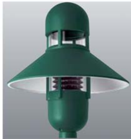
ZAV21-DTW-CLL / ZAV24-DTW-CLL