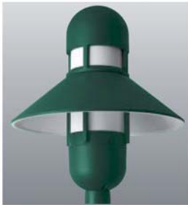
ZAV21-DTW-S / ZAV24-DTW-S