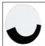
CL60x135 - Internal 60° Vert. x 135° Horiz. Lens Shielding