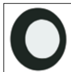
CL80x360 - Internal 80° Vert. x 360° Horiz. Lens Shielding